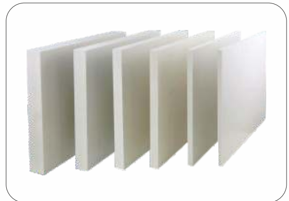
WPC & PVC Ply